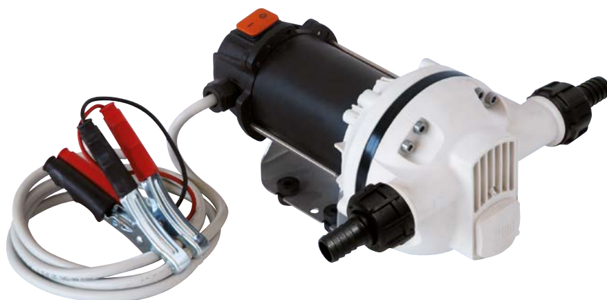
SUZZARABLU PUMP DC